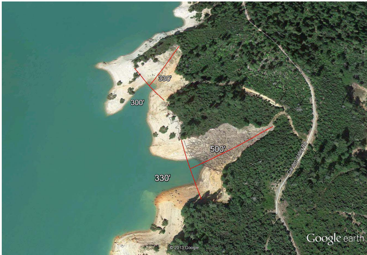
Figure 2.2-2. Primary and Secondary sites with the log booms in place and material stored in the Primary Site.

The Primary and Secondary burn sites are accessed by traveling 2.5 mi from County Road 158 along Garden Valley Road (USFS Road 0125-013), which is gated by the Forest Service at two locations and is closed from January 1 through August 31. The first gate is located near the end of County Road 125, and the second gate is located on Garden Valley Road at its intersection with Forest Service Road 125-13-02. From Garden Valley Road, the Primary Burn Site is accessed over a 0.1-mi long skid road, which is opened and closed by YCWA each year it uses the skid road. The skid roads do not have a Forest Service road designation. The Secondary Burn Site is accessed by a 0.1-mi long skid road from the skid road that accesses the Primary Burn Site (Figure 2.2-2).