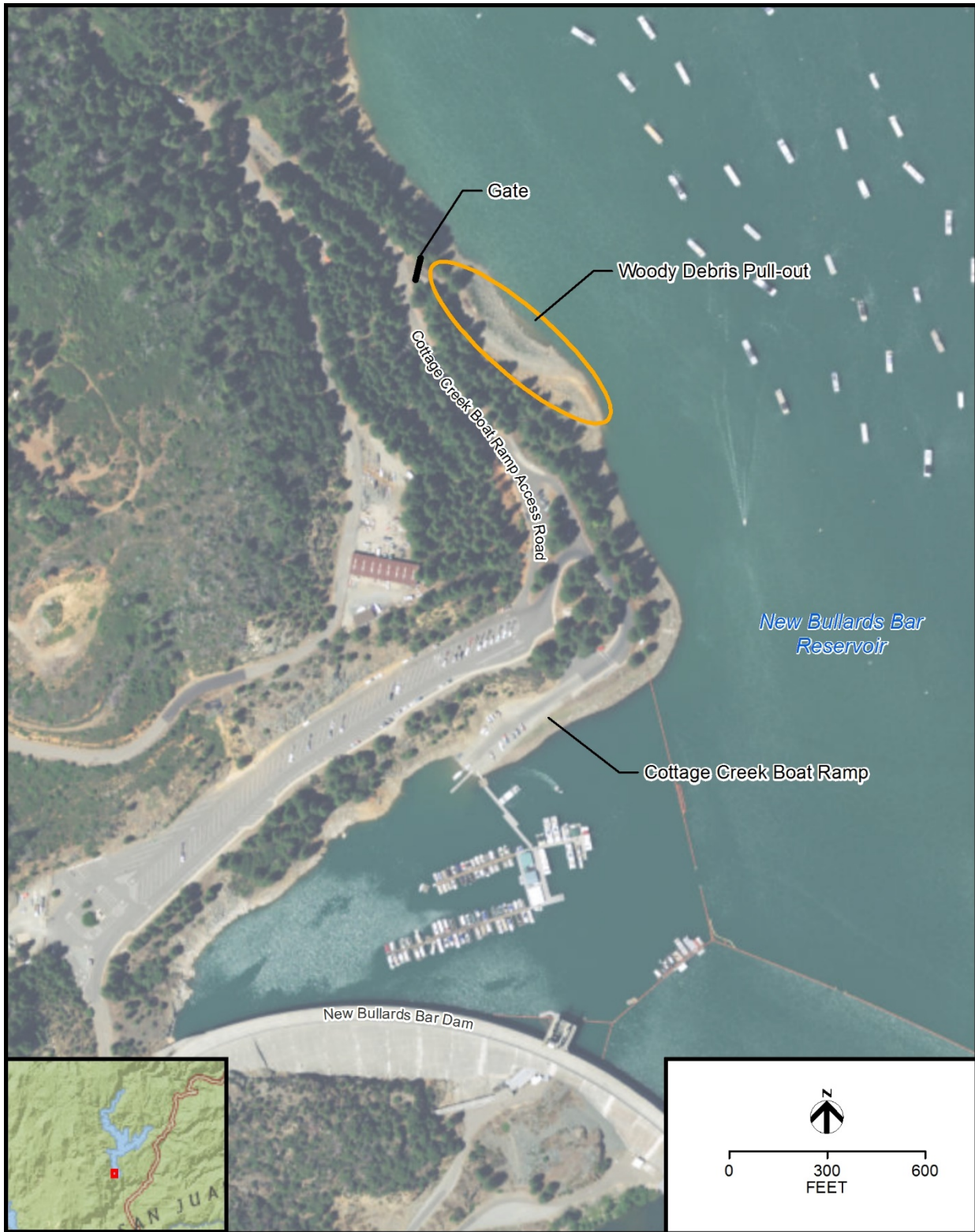
Figure 2.2-3. Location where YCWA removed woody material form New Bullards Bar Reservoir in 2017.