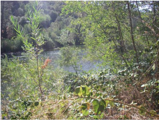
Habitat Mapping Unit 1 – Run