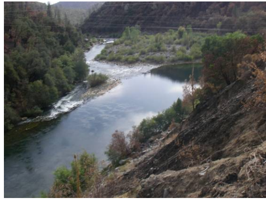
Habitat Mapping Unit 11 – Mid-Channel Pool