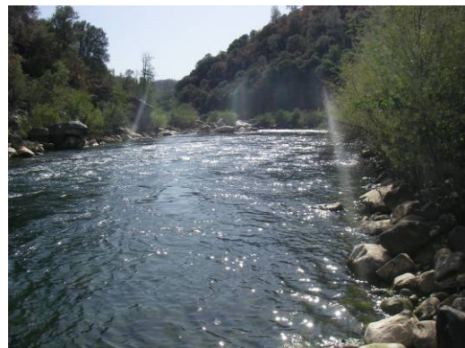
Habitat Mapping Unit 9 – Run