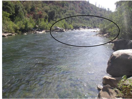
Habitat Mapping Unit 7 – Rapid