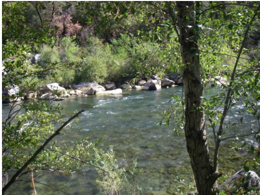
Habitat Mapping Unit 5 and 6 – Low Gradient Riffle