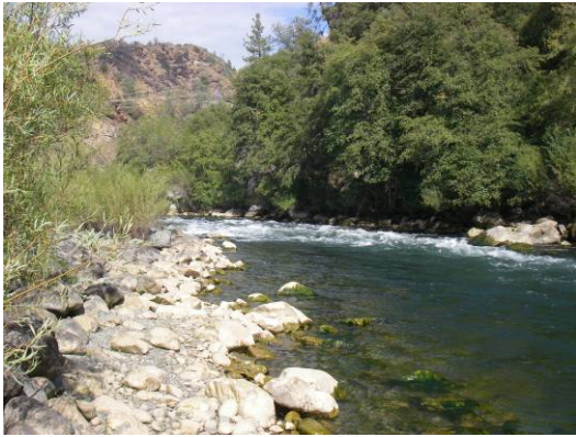
Habitat Mapping Unit 1 – Rapid