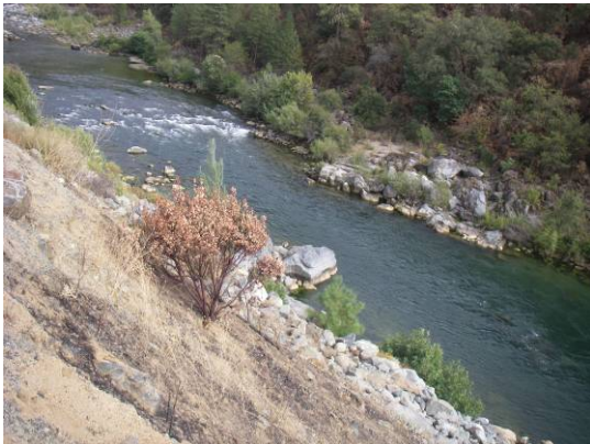
Habitat Mapping Units 12 and 13 – Rapid and Run