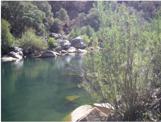
Habitat Mapping Unit 3 –Mid-Channel Pool