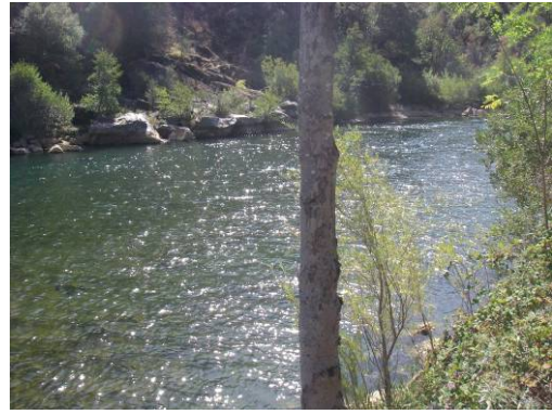
Habitat Mapping Unit 2 – Glide