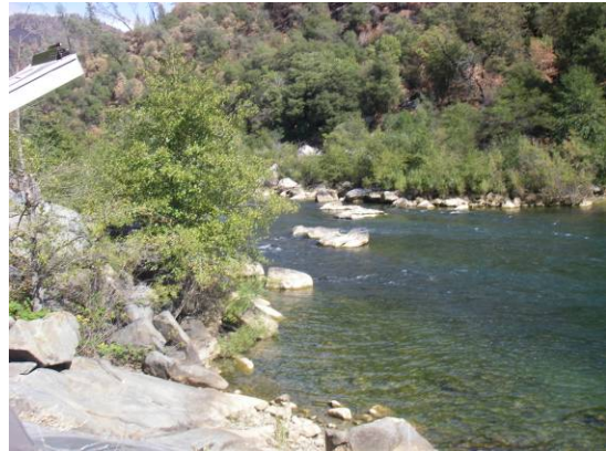
Habitat Mapping Unit 4 – Run