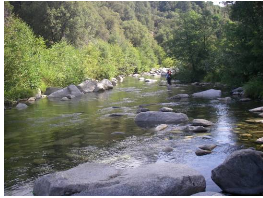
Habitat Mapping Unit 9 – Glide