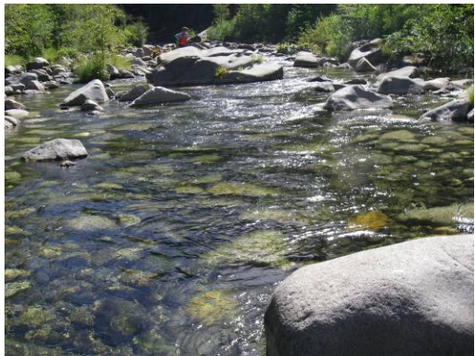
Habitat Mapping Unit 15 –Run