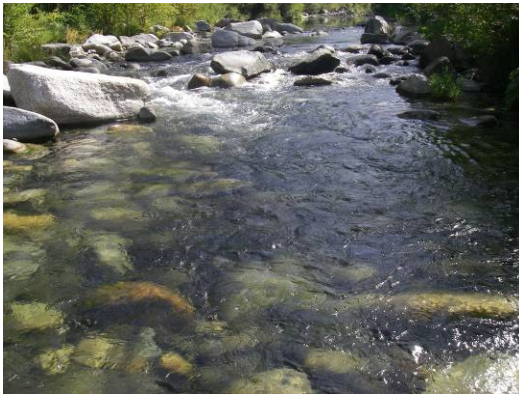
Habitat Mapping Unit 10 –Step-Run