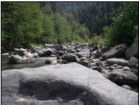
Habitat Mapping Unit 27 –High Gradient Riffle