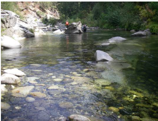
Habitat Mapping Unit 20 – Mid-Channel Pool