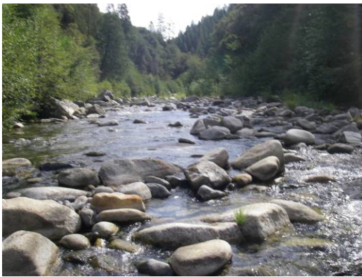
Habitat Mapping Unit 12 – Low Gradient Riffle