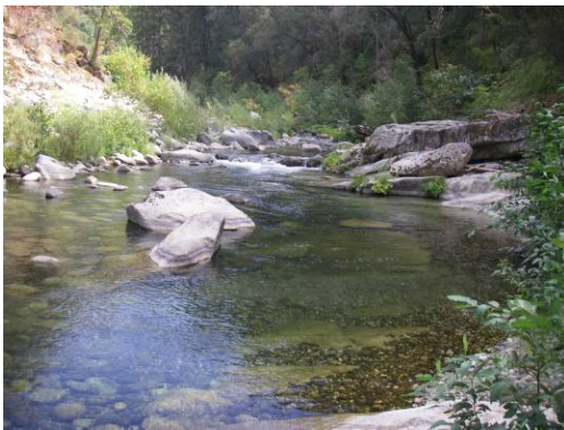
Habitat Mapping Unit 18 –Mid-Channel Pool