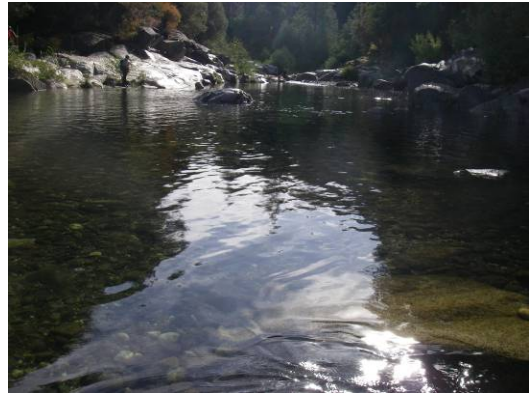
Habitat Mapping Unit 2 – Mid-Channel Pool