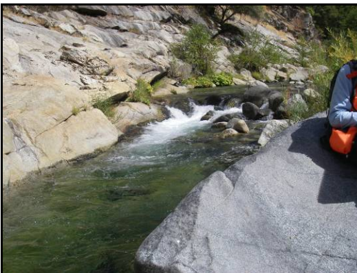
Habitat Mapping Unit 25 –Chute