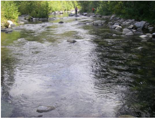
Habitat Mapping Unit 8 – Run