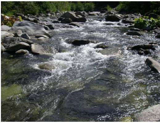
Habitat Mapping Unit 16 – Low Gradient Riffle