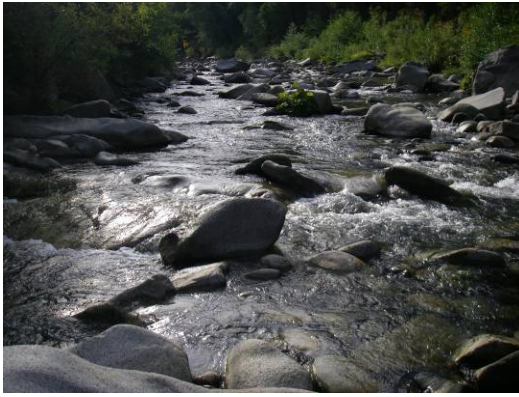
Habitat Mapping Unit 1 – Step-Run