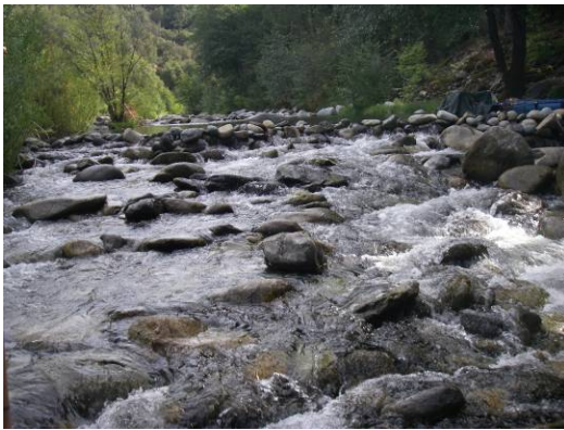
Habitat Mapping Unit 6 –High Gradient Riffle