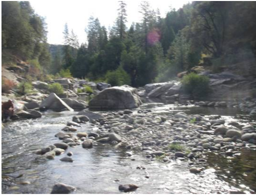
Habitat Mapping Unit 3 –Low Gradient Riffle