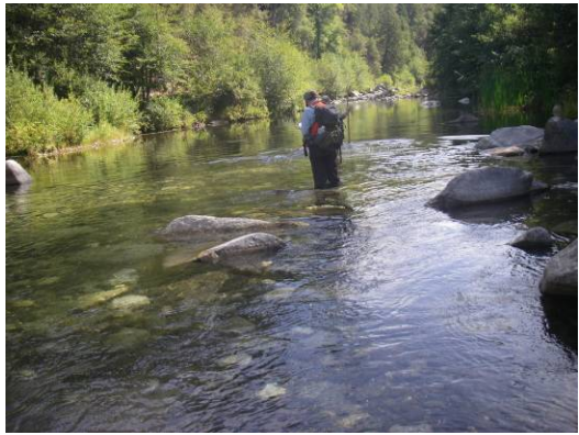
Habitat Mapping Unit 11 – Mid-Channel Pool