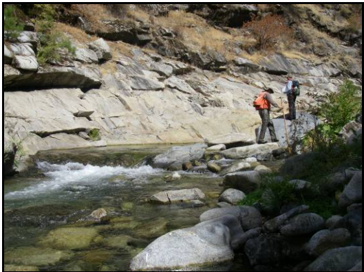
Habitat Mapping Unit 24 – Rapid