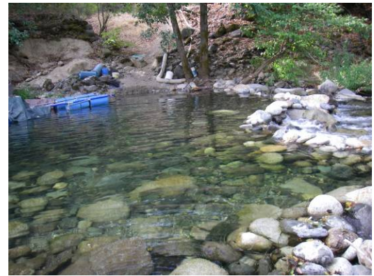
Habitat Mapping Unit 7 –Mid-Channel Pool