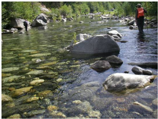
Habitat Mapping Unit 13 – Glide