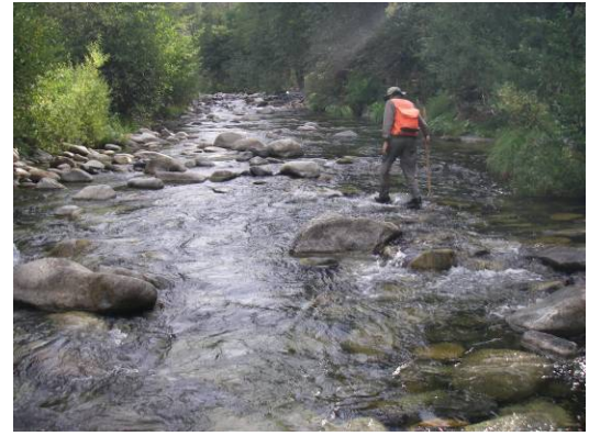
Habitat Mapping Unit 5 – Low Gradient Riffle