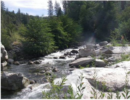
Habitat Mapping Unit 4 – High Gradient Riffle