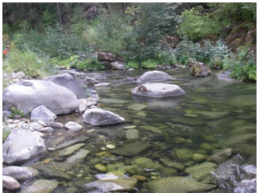
Habitat Mapping Unit 19 – Step-Run