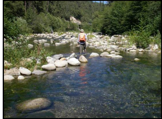
Habitat Mapping Unit 3 – Mid-Channel Pool