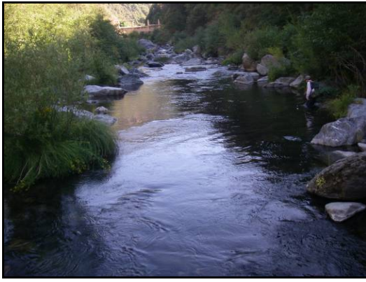
Habitat Mapping Unit 9 – Mid-Channel Pool