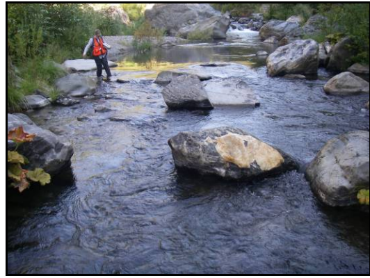
Habitat Mapping Unit 12 – Run