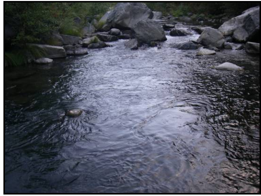
Habitat Mapping Unit 4 – Mid-Channel Pool