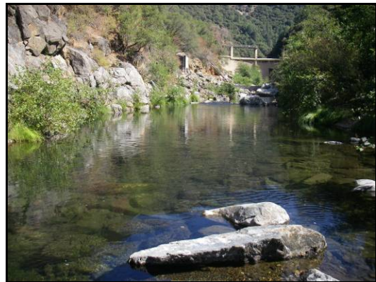
Habitat Mapping Unit 15 –Mid-Channel Pool