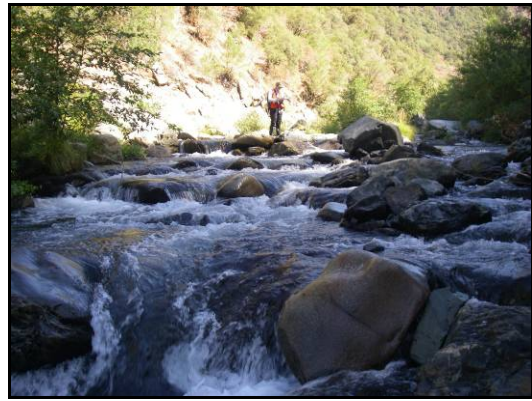
Habitat Mapping Unit 14 – Cascade