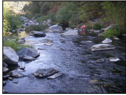
Habitat Mapping Unit 10 – Run