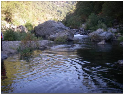
Habitat Mapping Unit 13 – Mid-Channel Pool