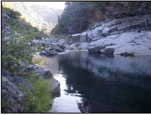
Habitat Mapping Unit 1 – Mid-Channel Pool