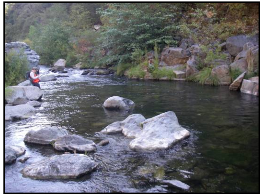
Habitat Mapping Unit 6 – Lateral Pool