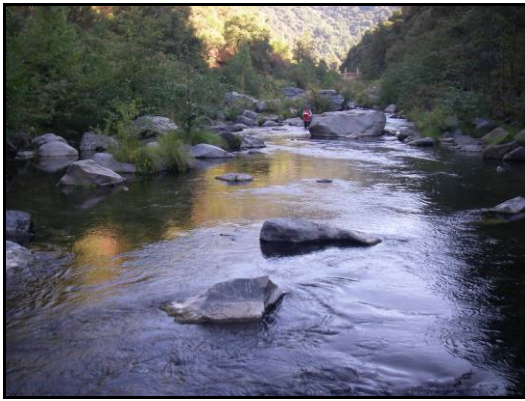
Habitat Mapping Unit 5 – Run