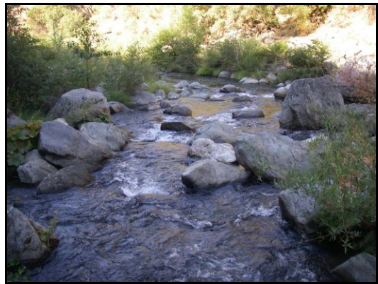
Habitat Mapping Unit 8 –High Gradient Riffle