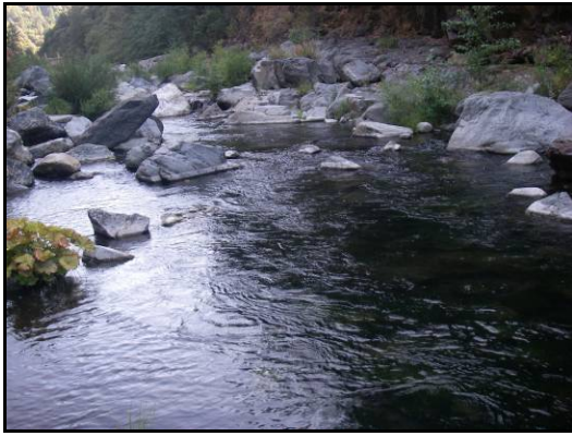
Habitat Mapping Unit 3 – Run