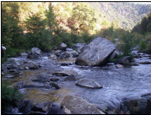
Habitat Mapping Unit 7 –Low Gradient Riffle