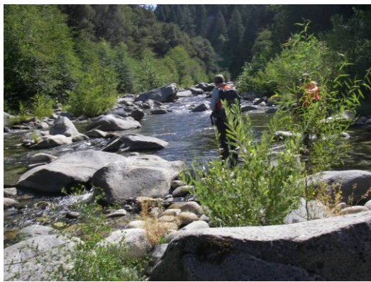
Habitat Mapping Unit 14 –Low Gradient Riffle