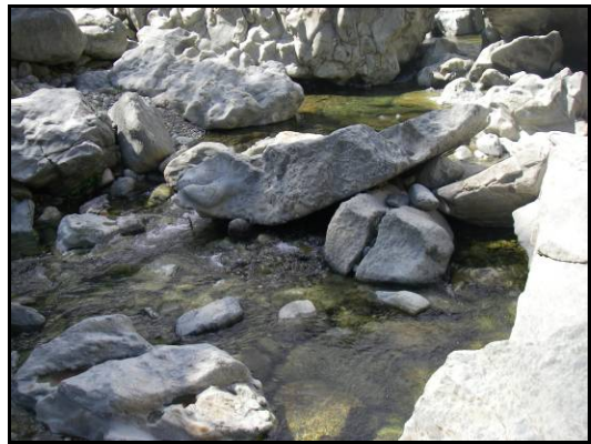
Habitat Mapping Unit 9 – Pocket Water