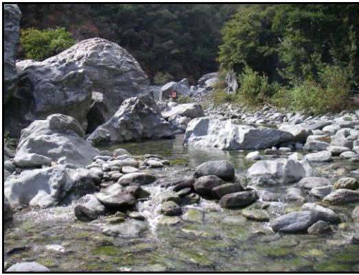
Habitat Mapping Unit 14 – Step-Run