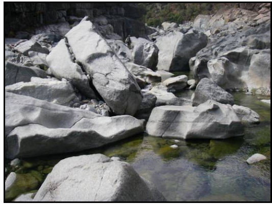
Habitat Mapping Unit 7 – Pocket Water