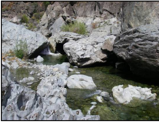
Habitat Mapping Unit 4 – Pocket Water