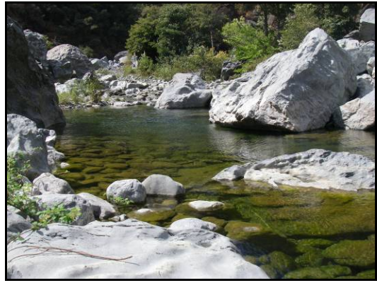
Habitat Mapping Unit 13 – Mid-Channel Pool