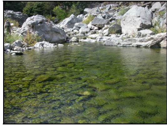
Habitat Mapping Unit 11 – Mid-Channel Pool