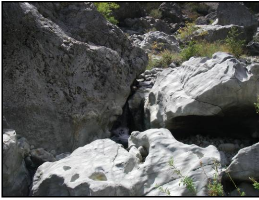
Habitat Mapping Unit 10 – Falls