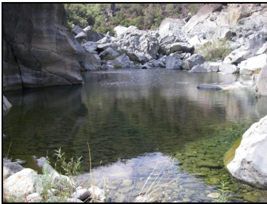
Habitat Mapping Unit 8 – Mid-Channel Pool