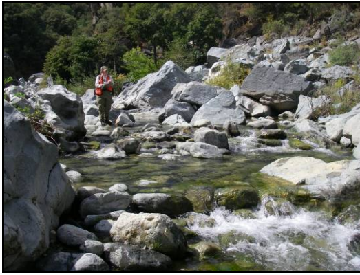
Habitat Mapping Unit 12 –High Gradient Riffle