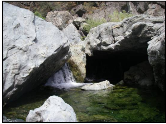
Habitat Mapping Unit 5 – Falls