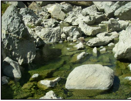
Habitat Mapping Unit 1 – Pocket Water