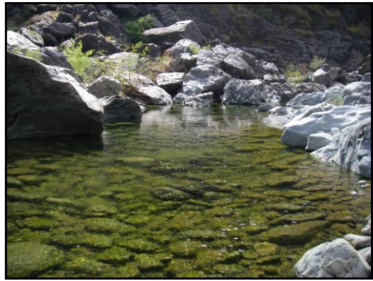
Habitat Mapping Unit 15 – Mid-Channel Pool