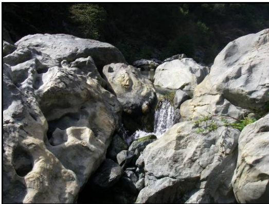
Habitat Mapping Unit 17 –Falls