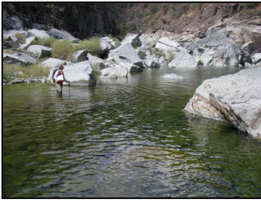
Habitat Mapping Unit 6 – Mid-Channel Pool