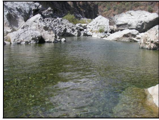
Habitat Mapping Unit 3 – Mid-Channel Pool