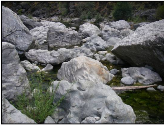
Habitat Mapping Unit 19 – Pocket Water