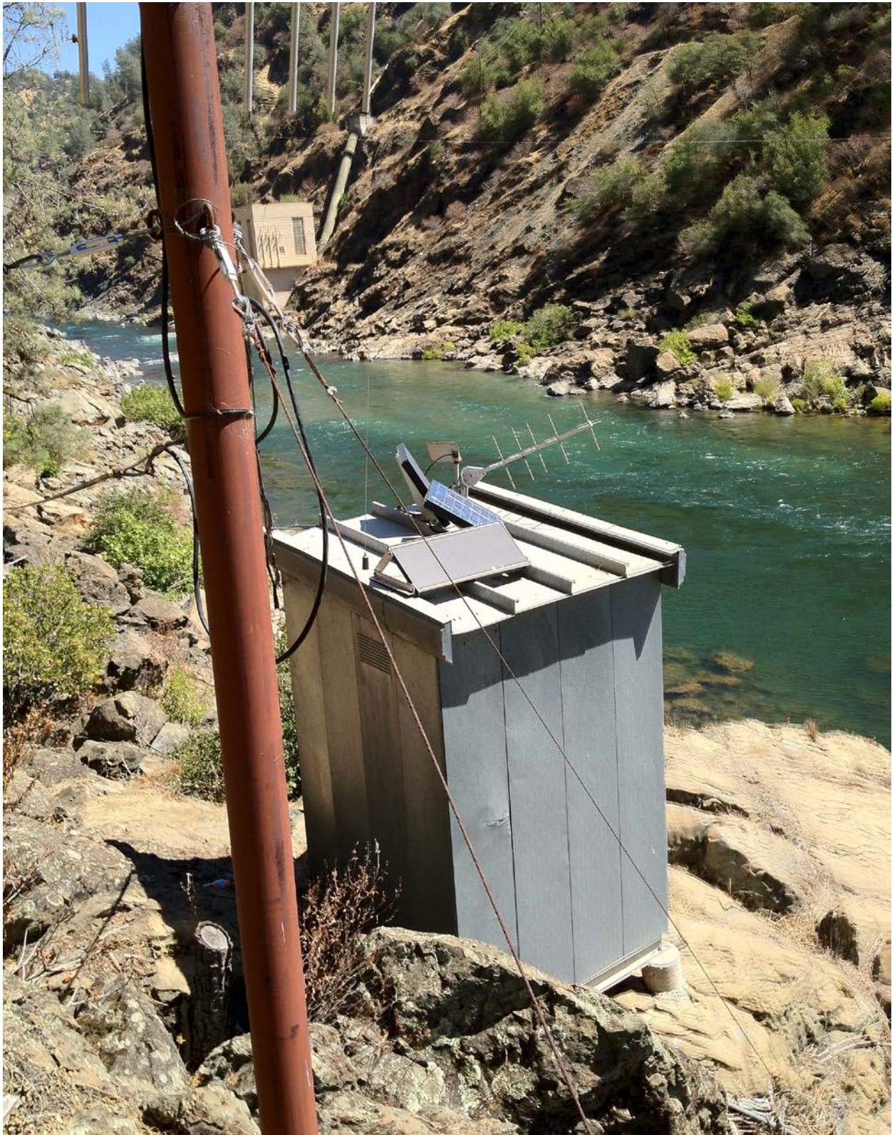
Figure 3.1-3. Streamflow gage on the Yuba River near Smartsville.