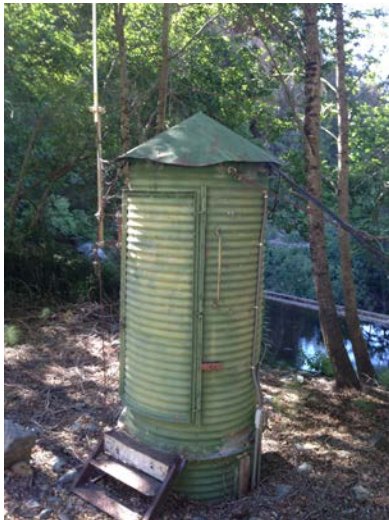
Figure 3.1-1. USGS Gage 11413517.

Figures 3.1-1 and 3.1-2 are pictures of the gage.