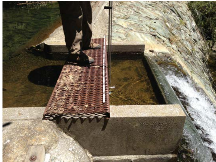
Figure 3.1-2. Measuring flow in USGS Gage 11413517 weir box.