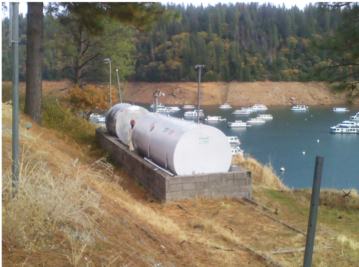
Figure 3.1-1. Photograph of Emerald Cove Marina fuel storage tanks.

The visual quality mitigation for the tanks is to paint them gray/green or brown to blend with the surroundings. If technical requirements prevent painting, an alternative mitigation is to construct dark colored fencing that would visually screen the white tanks.