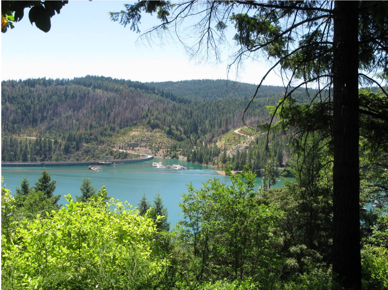
Figure 3.3-1. Photograph of the present view from Sunset Vista Point (KOP 7).

The visual quality enhancement activities involving vegetation removal are as follows: