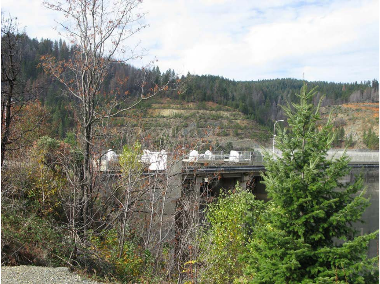
Figure 3.2-1. Photograph of the New Bullards Bar Dam gate controls and housings.

The visual quality mitigation for the control gate and housings is to paint them in the color of existing steel structures on the dam (preferably green) so they blend with the surroundings.